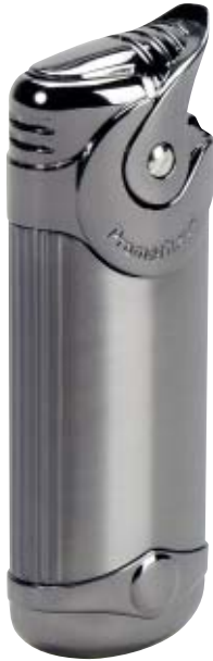
02 gun metal

dimensions: 3.1 inches x 1.1 x 0.7 (78 mm x 29 x 18)