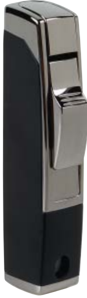
06 black matte / gun metal

Xen $75.00 torch flame wind-resistant dimensions: 3.2 inches x 0.9 x 0.5 (82 mm x 24 x 15)