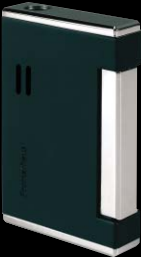
05 black matte / chrome