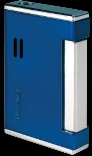
07 metallic blue