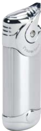
04 satin chrome