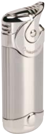
03 satin nickel