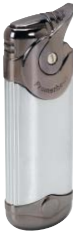
4A satin chrome / gun metal