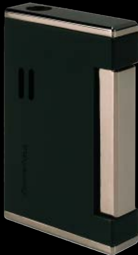
06 black matte / gun metal