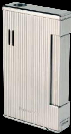
X3 shaper cut / palladium