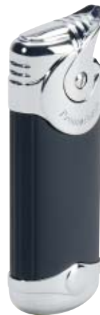
05 black matte / chrome