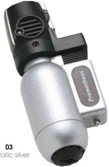
03 metallic silver

dimensions: 3.1 inches x 1.3 x 0.8 (78 x 32 x 21)