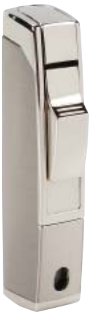
01 satin nickel