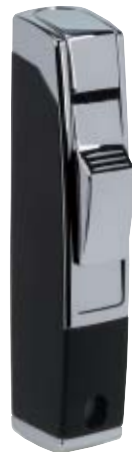
05 black matte / polish chrome