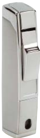
03 satin chrome