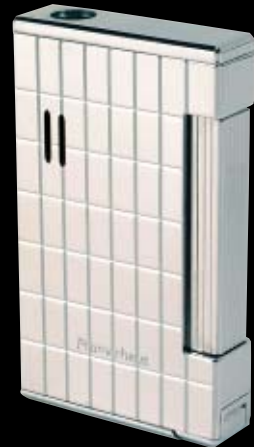
X4 crisscross / palladium