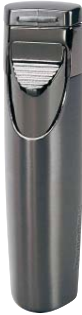
02 gun metal

dimensions: 3.2 inches x 0.9 x 1.1 (82 mm x 22 x 27)