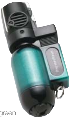
05 metallic green