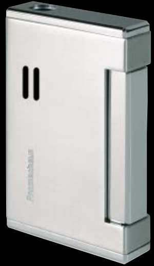
03 satin chrome