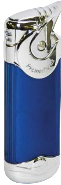
07 metallic blue