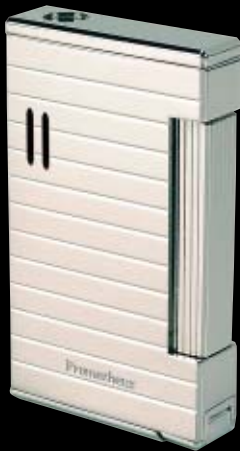
X2 horizontal / palladium

Prometheus Ultimo with a built-in, punch cutter (U.S. Patent 6,298,856 & 6,732,741)