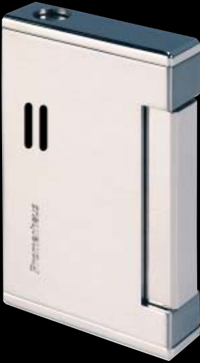
01 satin nickel

torch flame wind-resistant dimensions: 2.3 inches x 1.4 x 0.4 (57 mm x 37 x 11)