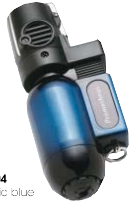
04 metallic blue