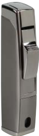
02 gun metal