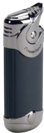
06 black matte / gun metal