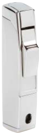
04 polish chrome