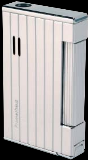
X1 vertical / palladium

palladium-plated torch flame with punch cutter wind-resistant dimensions: 2.4 inches x 1.4 x 0.4 (62 mm x 37 x 11)