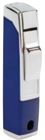
07 metallic blue