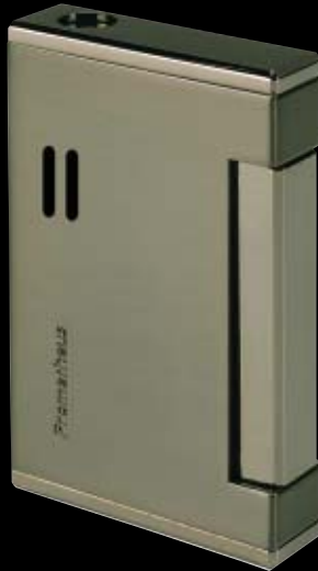
02 gun metal