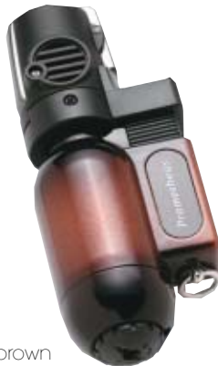
06 metallic brown