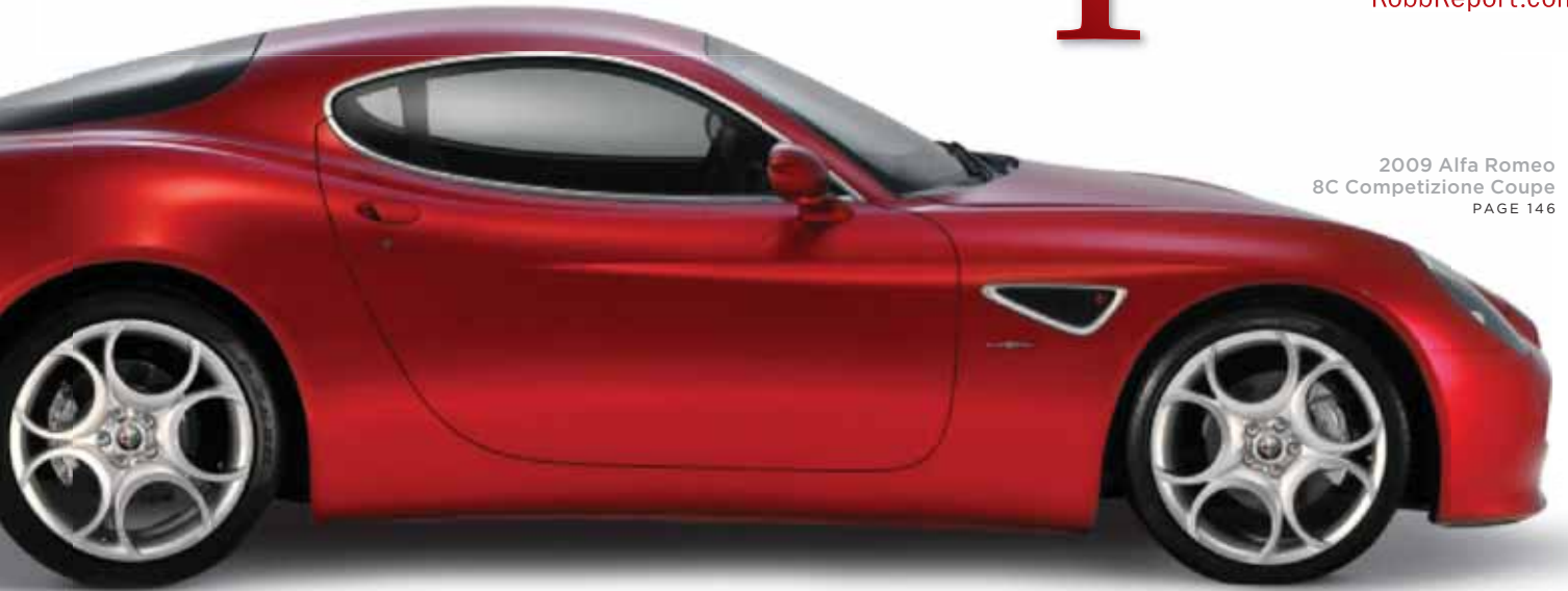
2009 Alfa Romeo 8C Competizione Coupe PAGE 146