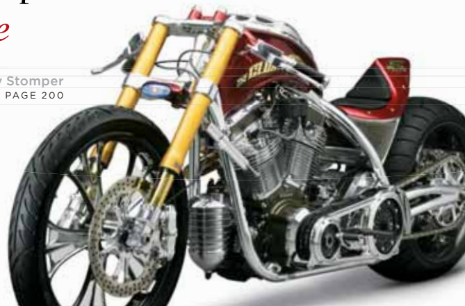
The Glory Stomper PAGE 200

FEATURING: Prometheus LIMITED EDITION GOD OF FIRE